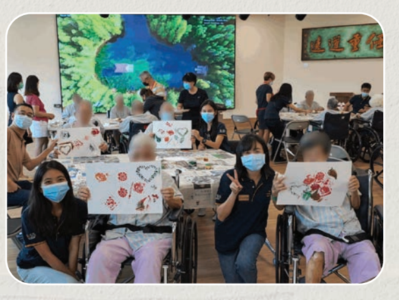
NSHD COMMUNITY OUTREACH – FUN CRAFT CLUB @ KWONG WAI SHIU HOSPITAL