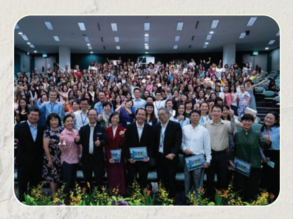
EARLY CHILDHOOD EDUCATION CHINESE SYMPOSIUM