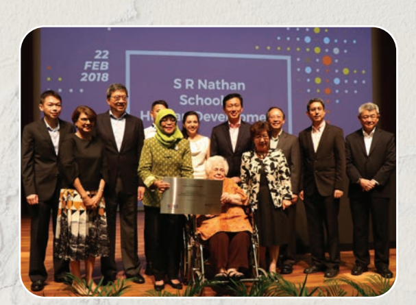
NSHD RENAMING EVENT