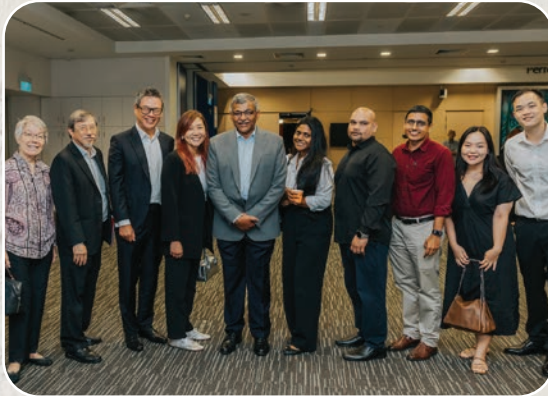
A TALK WITH THE HONOURABLE THE CHIEF JUSTICE SUNDARESH MENON