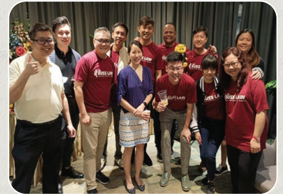
LAW FRATERNITY GAMES