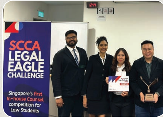
SCCA LEGAL EAGLE CHALLENGE