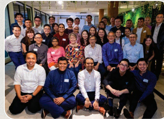
LAW ALUMNI EVENT